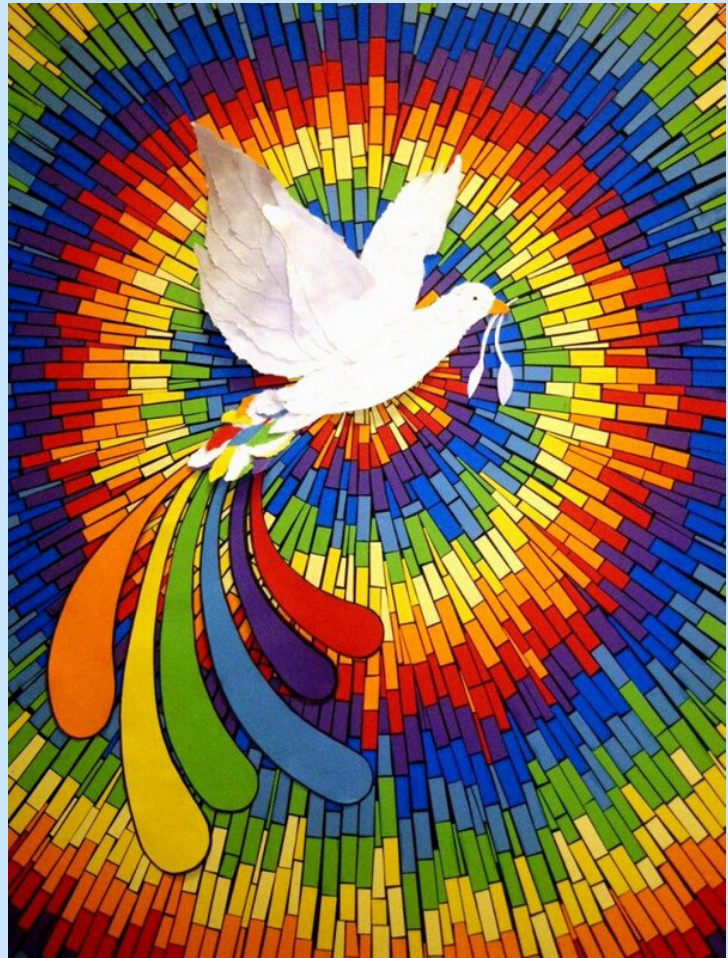
Peace Mala Dove of Peace by Hafod PrimarySchool Swansea

In the picture above the dove is carrying and sending out the message of peace.